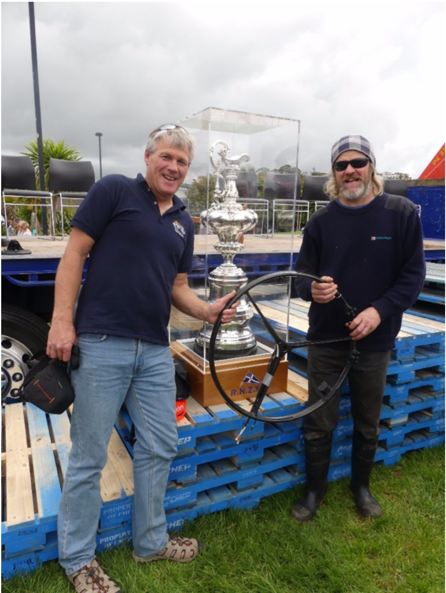
Top Secret Photo of Advanced Race Technology